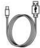
Type-C Cable (x1)