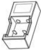
Battery Charger (x1)