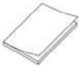
Quick Start Guide(x1)

COMPLIANCE NOTICE: The thermal series products might be subject to export controls in various countries or regions, including without limitation, the United States, European Union, United Kingdom and/or other member countries of the Wassenaar Arrangement. Please consult your professional legal or compliance expert or local government authorities for any necessary export license requirements if you intend to transfer, export, re-export the thermal series products between different countries.